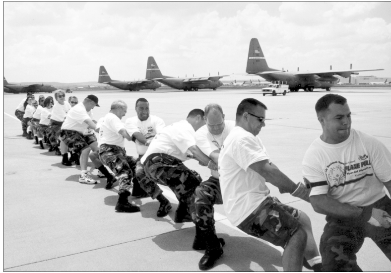
Special Olympics Kentucky