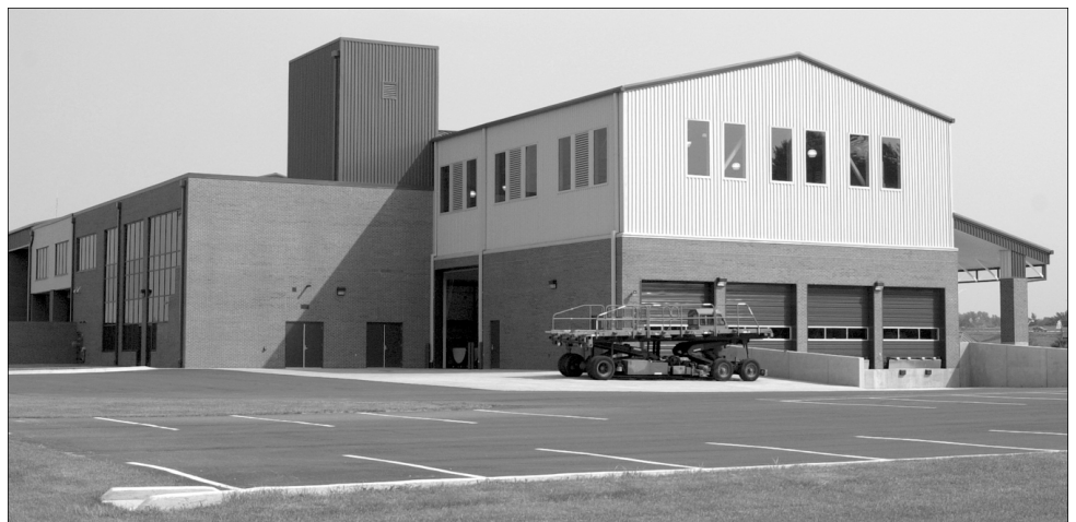
Master Sgt. Charles Simpson/KyANG

The Air Transportation and Special Tactics Complex was authorized as part of the Kentucky Air Guard's 1995 base relocation, but construction wasn't funded until 1998.